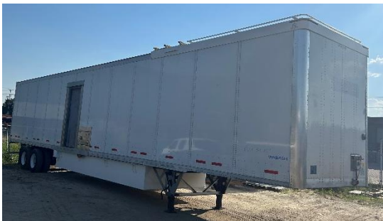
* Tower lowered for transport