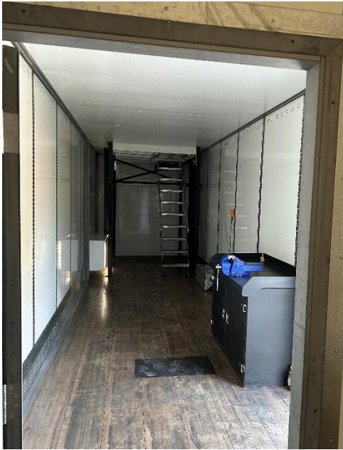
Switch Gear room with work bench & access to tower